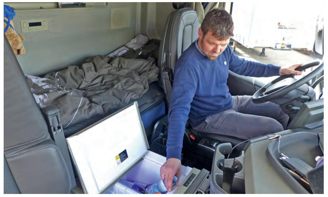
The FH's coffee maker is located between the driver's seat and the 33-litre cool box, but cool drinks are still within easy reach.

kilometre-long, very constant seven-per-cent downhill gradient stretch, here we do not want to exceed 68, which trucks with