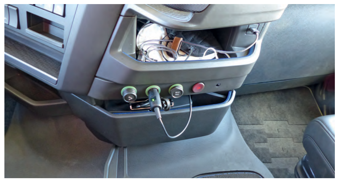
Three 12- and 24-V sockets are located in the middle, with a USB socket for a smartphone at the top. The red button activates the alarm system in the event of a robbery or an emergency.

model FH 500, also with a turbo compound, driven in 2019. Too bad, it had a retarder. But it's also interesting that it roa-