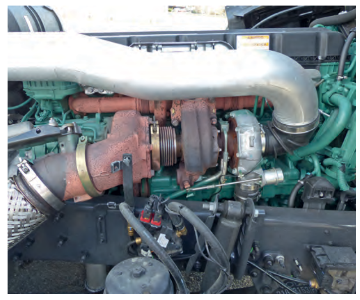
Two turbos are better than one, especially if the second one (left) acts directly on the crankshaft via a gear train and freewheeling. Volvo has perfected this turbo compound principle.

The setting options of I-See are also new and have been greatly simplified. The one- to three-star driving programs no longer exist, only the overshoot can still be freely selected and the driving program regulates the range of the undershoot. By the way, the standard program is now called "Balanced" – and that is exactly how it drives – in