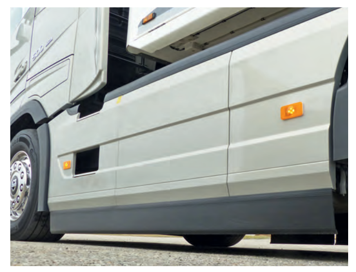
The enemy is air turbulence: New rubber lips on the side aprons leave only ten centimetres of clearance to the road, the mudguard mountings on the front axle narrow the gap to the tyres.

There is a whole range of other factors that mainly affect the rules by which Volvo's GPS cruise control I-See operates. Amazingly, the FH is now able to operate at speeds as low as 40 km/h instead of 60 km/h in