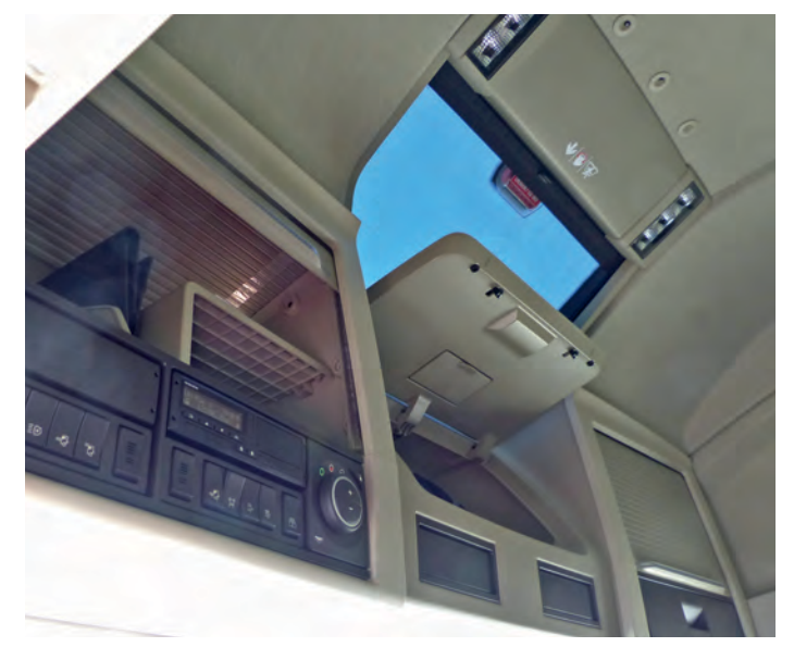
The front upper cabin features a large emergency exit and plenty of storage space behind blinds or flaps.

Conclusion: The operation was a success, the patient is really fast and still economical. What more could you want these days? rod