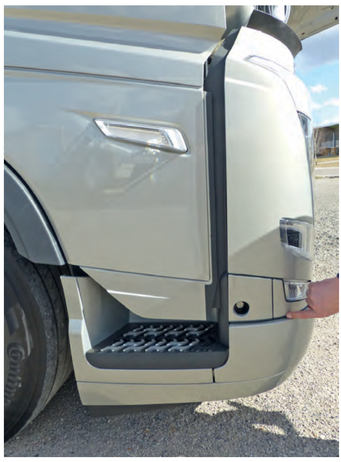
Tuning on all curves and roundings: Even smallest gaps are now sealed with gaskets. Especially the big gap which enables the cabines flexibility towards the fixed parts at the front.

that when operating predominantly under partial load (i.e. nearly all the time), the more moderate torque is used. But there is no denying it, where there is smoke, in the end there is fire, which means fuel is being unnecessarily consumed. And that is exactly what inhibits this two-torque-curve philosophy. These days, the computer knows best how the engine can practically always