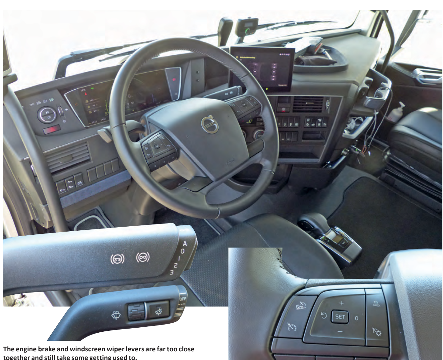
together and still take some getting used to.

as all that: Shifting down on a downhill stretch? Wouldn't the whole vehicle immediately start getting out of control? Yep. In normal circumstances and if the gradient is steep enough. The antidote is "co-braking" with the foot brake, or "brake blending",