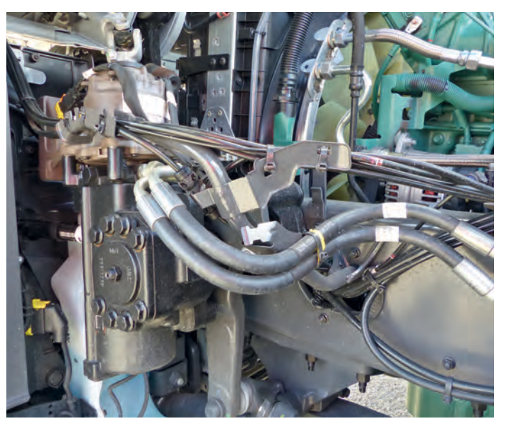
The electrically boosted and adjustable Dynamic Steering can be set to suit a wide range of individual preferences, which takes some getting used to and a lot of trial and error.